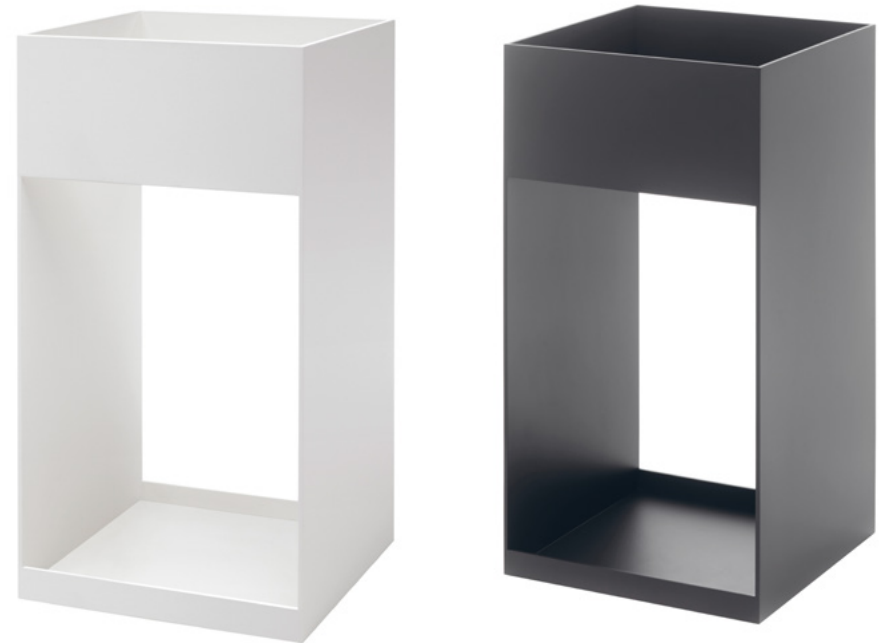
Soft-touch powder-coated slate black or white