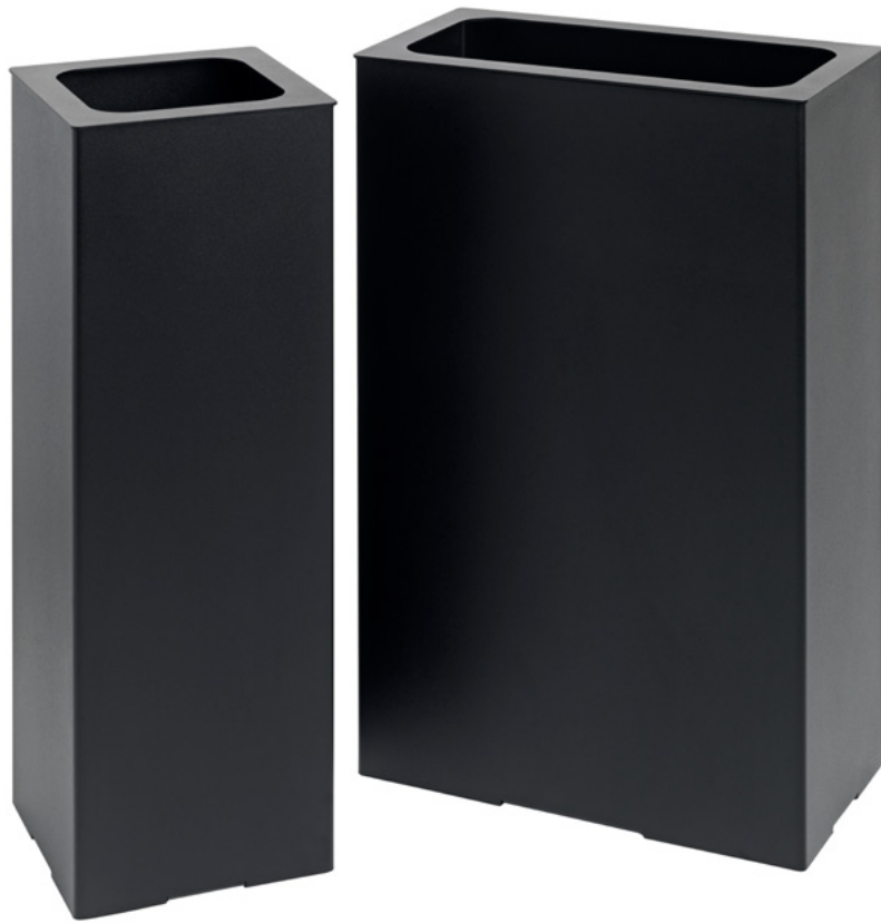
Steel powder-coated black, fine-structure